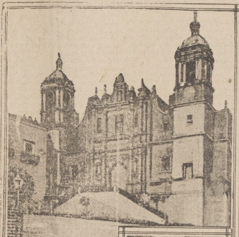
TEMPLE OF SANTO DOMINGO, ZACATECAS