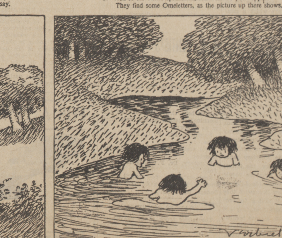
6.—"It will not take us long to clean ourselves," the Tinies shout.

"Next week we'll have some brand new things to tell you all about."