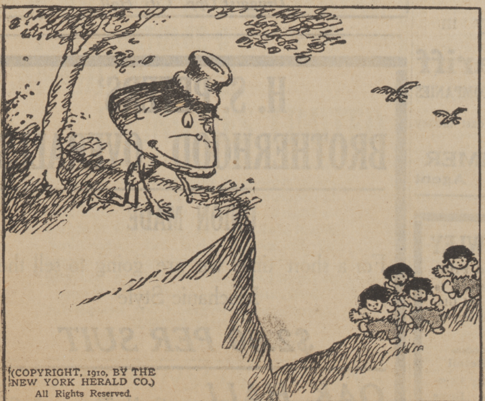
4.—They eat the Omeletters, then they gaily walk along, Enjoying everything they see, suspecting nothing wrong.

"Next week we'll have some brand new things to tell you all about."