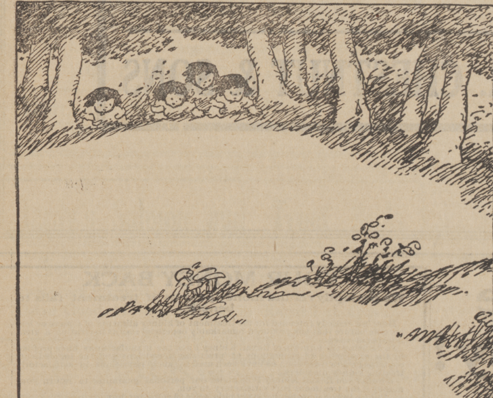
-The Tiny Tads are wondering what kind of things those are; They think they must be Mailboxen, but can't tell from so far.