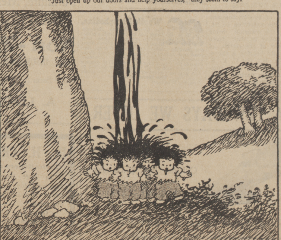
5.—But see what happens to their heads! Down comes a lot of ink! It is a Hobgoblinkbottle who daubs them thus, I think.