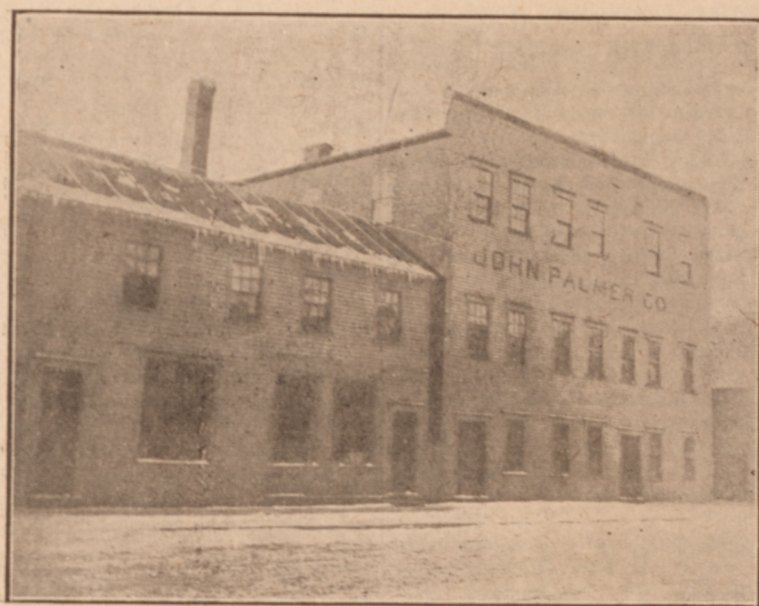
JOHN PALMER COMPANY'S FACTORY.

The output of the Palmer factory is sold from the International Foundry to the Yukon and from Newfoundland to the Pacific Coast. The larrigans and shoe-packs manufactured in this city are to be found in