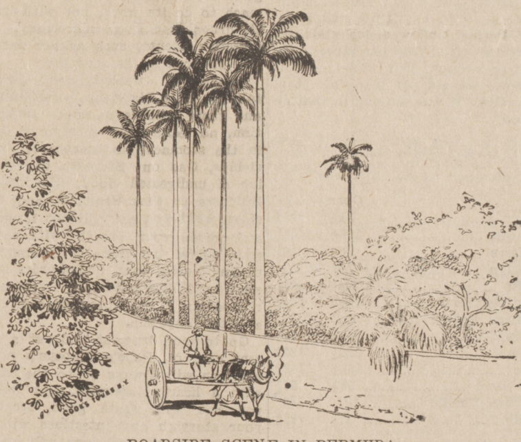
ROADSIDE SCENE IN BERMUDA.

tur as the steamer approaches the wharf. Its white houses, glistening in the bright sunshine, rise from the water front on a gentle eminence, and contrast pleasantly with the green foliage of many gardens. On the busy wharf are gathered many people, for the arrival of the steamer from New York is quite an event in Bermuda. The formalities of the Custom House are quickly and courteously transacted, and serve chiefly to remind the visitor that he is in a foreign land, but still within the realms of His Majesty King George V. Bermuda's houses are built of coral,