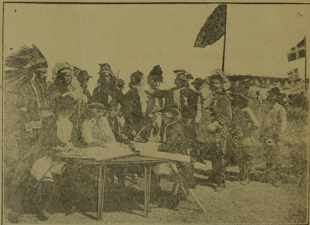
SCENE OF "WOLFE AND THE CONQUEST OF QUEBEC" AT THE GAIETY THEATRE FRIDAY AND SATURDAY.