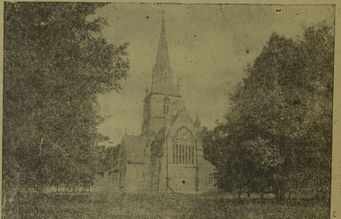
CHRISTCHURCH CATHEDRAL, FREDERICTON, N. B.