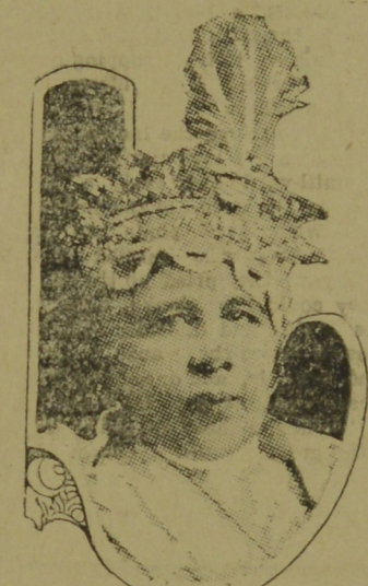
THE BEGUM OF BHOPAL

The living-room of some of the igloos are curtained off to separate the sleeping quarters from other parts of the household, but the majority have no such arrangements, all the household duties being conducted in the single room. The furniture equipment usually consists of a small stove, a few dishes, and improvised beds. The board floor, which is usually fairly clean, serves the purpose of chairs and tables. A few of the families own sewing machines and occasionally a phonograph.