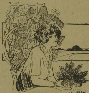
IN THE HOME.