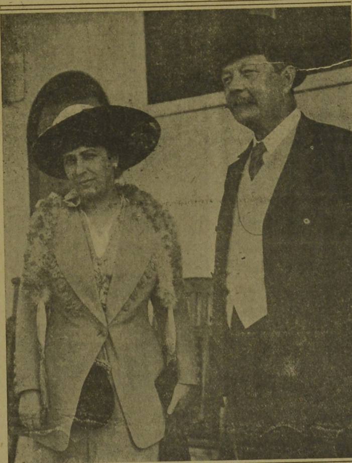
SIR CONAN AND LADY DOYLE. Noted Author and Wife Now Visiting the Canadian West.