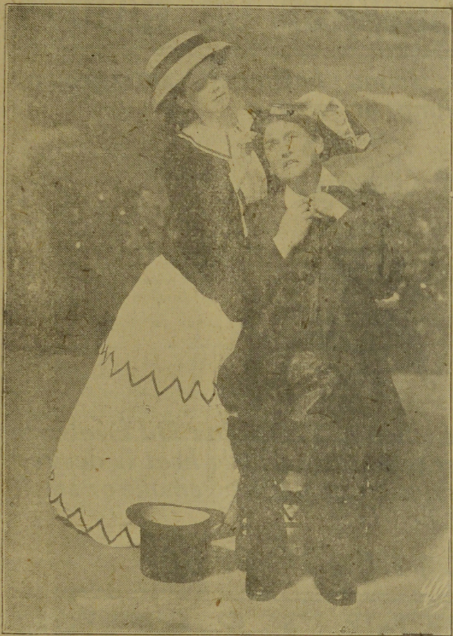
BUNTY AND WILLUM IN THE FAMOUS SCOTCH COMEDY, "BUNTY PULLS THE STRINGS," AT THE OPERA HOUSE TOMORROW NIGHT