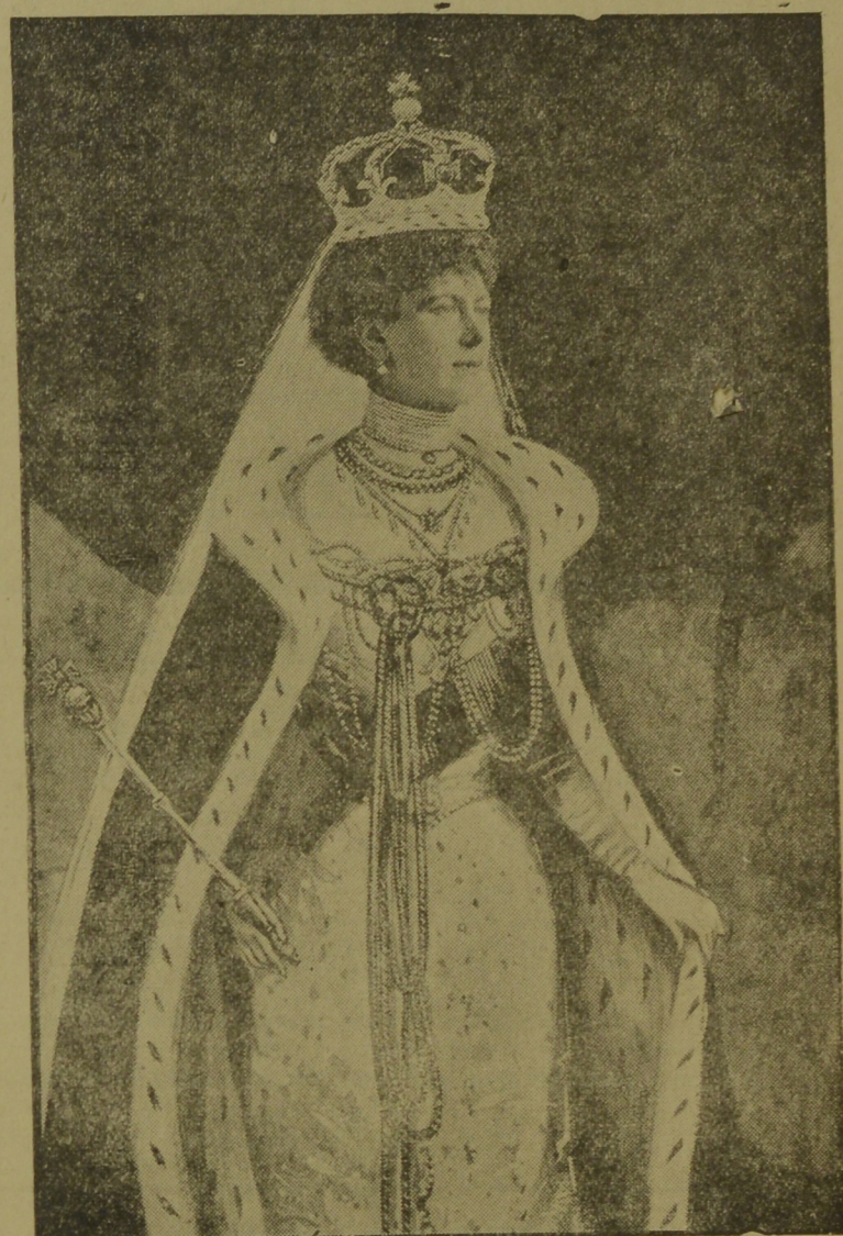
HER MAJESTY QUEEN MARY

Husbands and fathers, sons and brothers may go to battle, but all the hordes of warring Europe shall not force them to leave grim privation and terror of want encamped at their hearthstones.