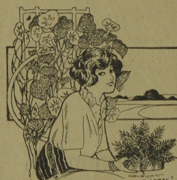
IN THE HOME.

Makes Sweeping Dustless. Only 30c for 5 lb package.