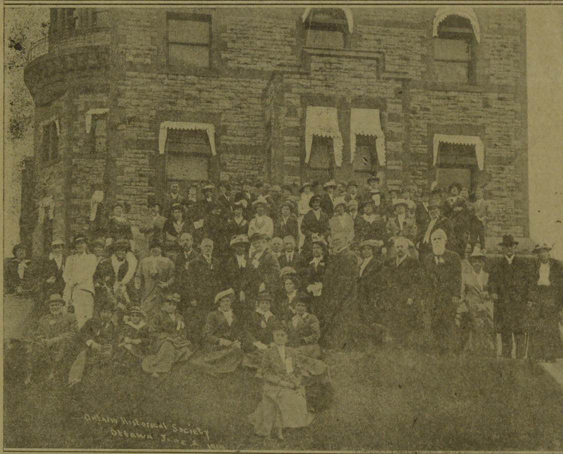
The Annual Convention of the Ontario Historical Society, Held at Ottawa, June 2nd.