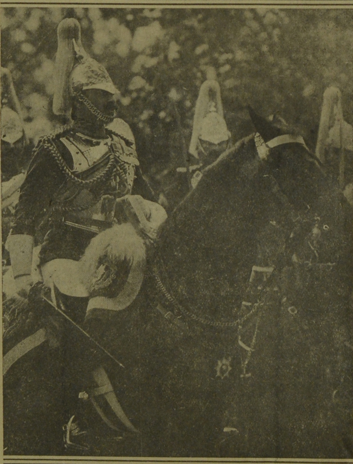
CANADA'S NEW GOVERNOR GENERAL.

Prince Alexander of Teck in command of the Guard of Honor of the 2nd Life Guards, saluting his brother-in-law the King at a recent levee.