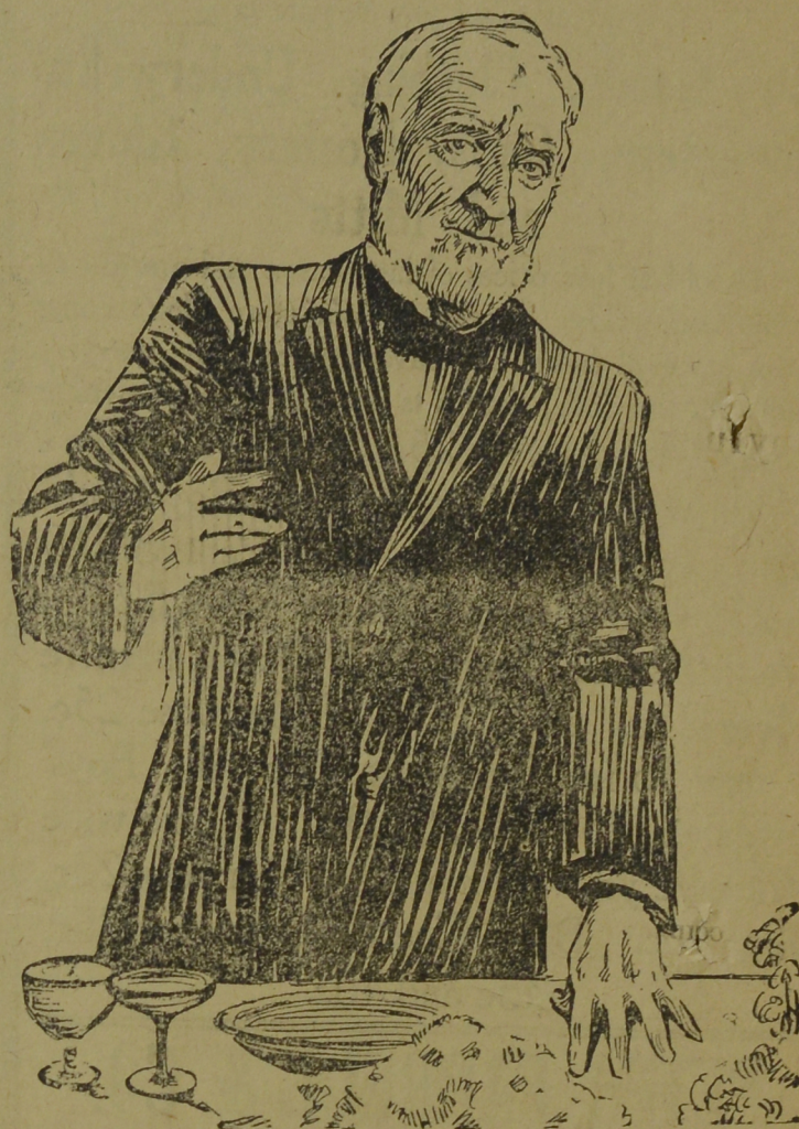
Re-elected to Congress Yesterday. in Illinois