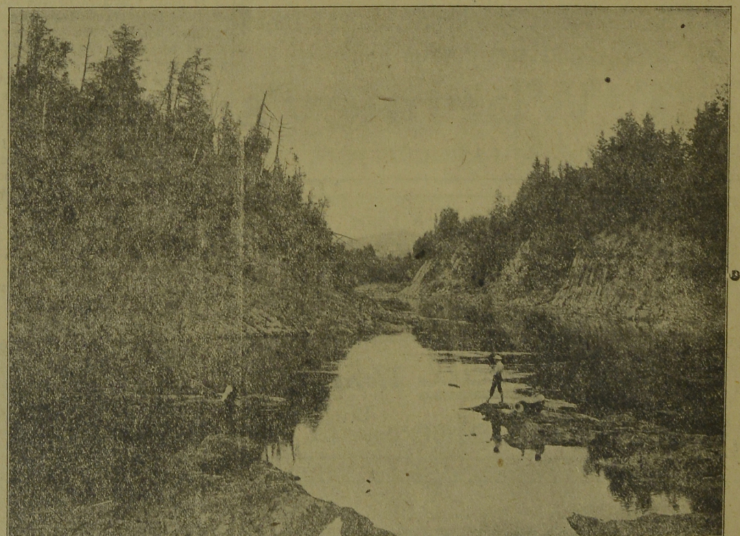
VIEW ON THE TOBIQUE.

We have lots of them and will supply them to you neatly printed. Fifty cents per pack. Send along your name and the money and we will pay the postage. Be up to the times.