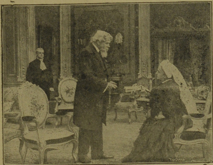
Her Majesty and Chas. Dickens