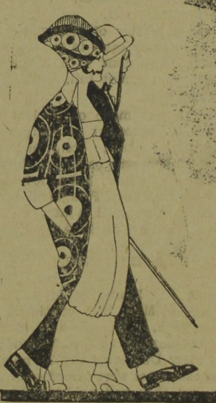
Liked the Chorus

They were leaving a theatre, where a musical comedy is now playing.