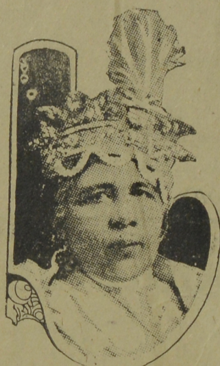
THE BEGUM OF BHOPAL

The Begum of Bhopal is the only woman ruler in India. She rules over a territory 6,874 square miles in extent, with a population of 900,000.