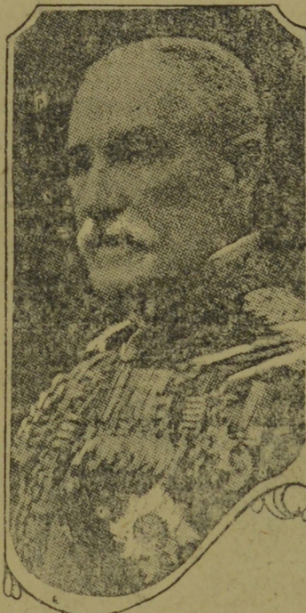
SIR HORACE SMITH-DORRIEN Chief of Staff to Sir John French

"In the direction of Erzerum one of our columns has made important progress above Juzveran. Our advance posts continued to tread the heels of the Turks. Other detachments are inactive."