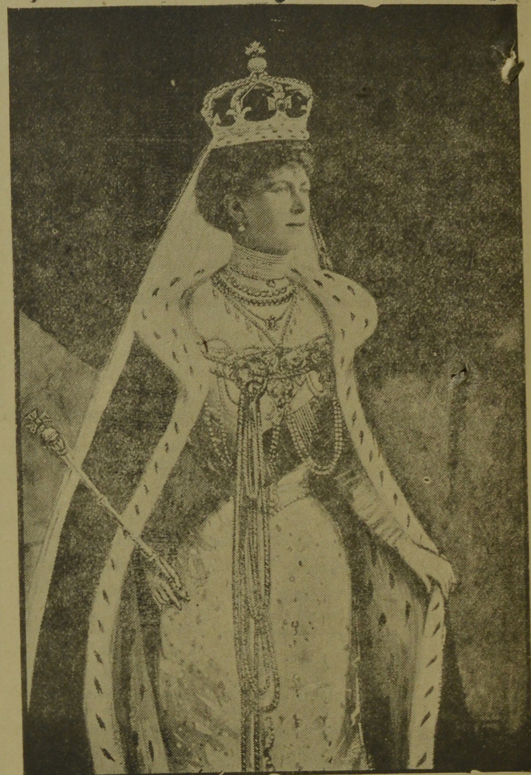
HER MAJESTY QUEEN MARY

Husbands and fathers, sons and brothers may go to battle, but all the hordes of warring Europe shall not force them to leave grim privation and terror of want encamped at their hearthstones.