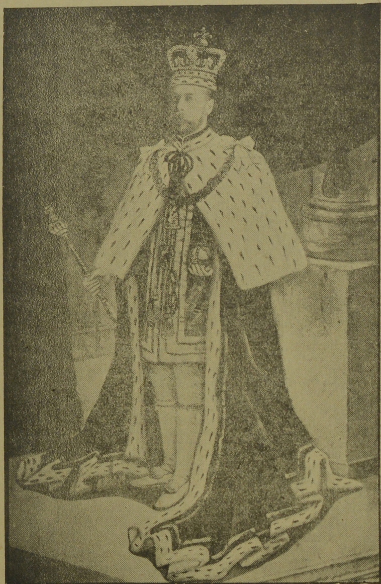
HIS MAJESTY KING GEORGE