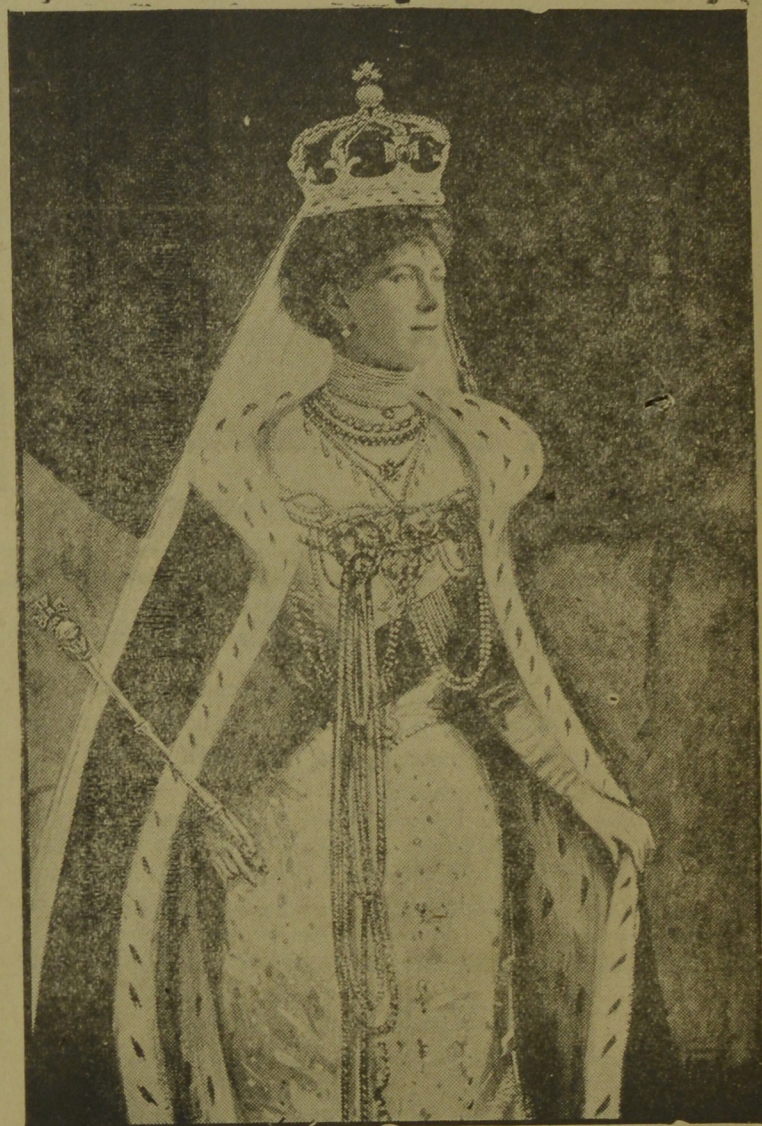
HER MAJESTY QUEEN MARY

Husbands and fathers, sons and brothers may go to battle, but all the hordes of warring Europe shall not force them to leave grim privation and terror of want encamped at their hearthstones.