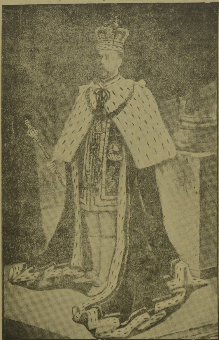
HIS MAJESTY KING GEORGE