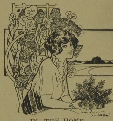
IN THE HOME.