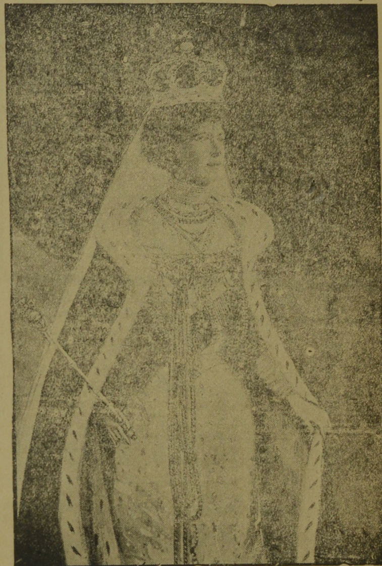
HER MAJESTY QUEEN MARY

Husbands and fathers, sons and brothers may go to battle, but all the hordes of warring Europe shall not force them to leave grim privation and terror of want encamped at their hearthstones.