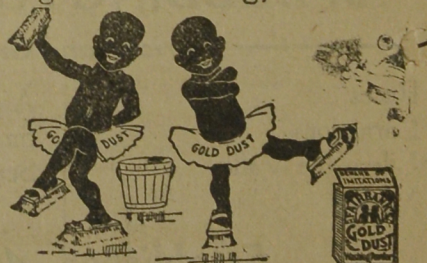
"Let the GOLD DUST do your work"

Your servant can do more and better work and keep sweet with the aid of GOLD DUST in all household cleaning.