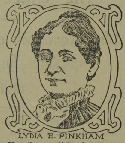
LYDIA E. PINKHAM

No other medicine has been so successful in relieving the suffering of women or received so many genuine testimonials as has Lydia E. Pinkham's Vegetable Compound. In every community you will find women who have been restored to health by Lydia E. Pinkham's Vegetable Compound. Almost every one you meet has either been benefited by it, or has friends who have. In the Pinkham Laboratory at Lynn, Mass., any woman any day may see the files containing over one million one hundred thousand letters from women seeking health, and here are the letters in which they openly state over their own signatures that they were cured by Lydia E. Pinkham's Vegetable Compound. Lydia E. Pinkham's Vegetable Compound has saved many women from surgical operations.