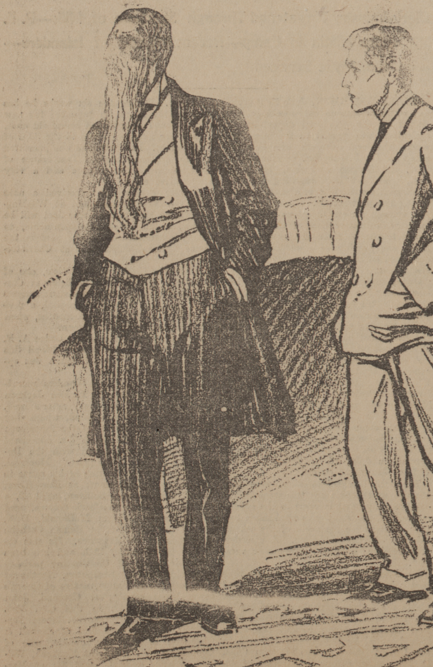
The Duke and His Secretary.