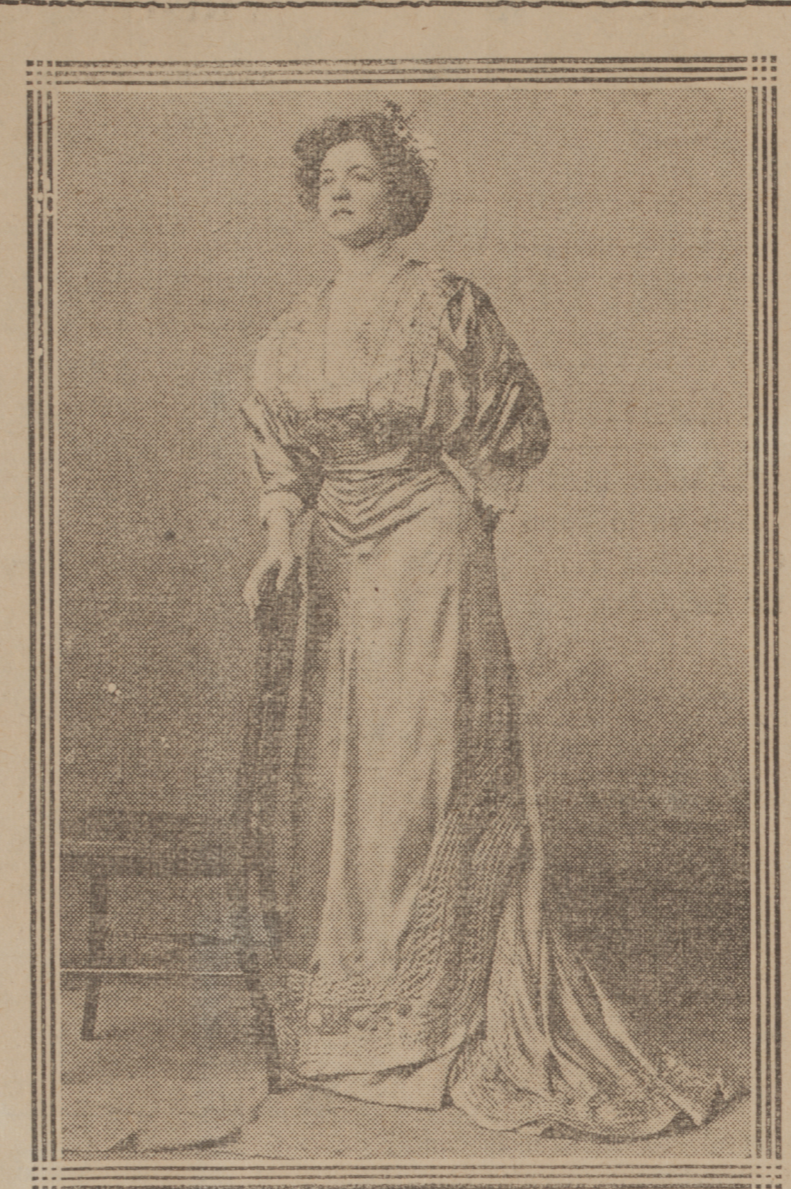
SIMPLE YET MOST EFFECTIVE.

At first glance this graceful reception toilette gives the impression of extreme elaboration. A closer study, however, reveals the actual simplicity of the hand needlework, which forms the only trimming of the gown. The embroidery is executed in coarse filocelle, which stands up richly from the fabric, and the long lines of the pattern are rarely in keeping with the graceful sweep and flow of the gown. The material—a very soft and supple Dretroire satin. The skirt, draped across the downward into one of the small trains, adopted for house wear. Notable is the front in the small "Paquin folds," sweeps which Paris women have enthusiastically draped sleeves, in one with the boules, and caught lightly to the undersleeve of tucked chiffon.