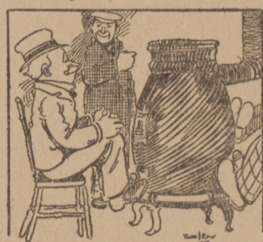
Sitting around the red-hot stove.