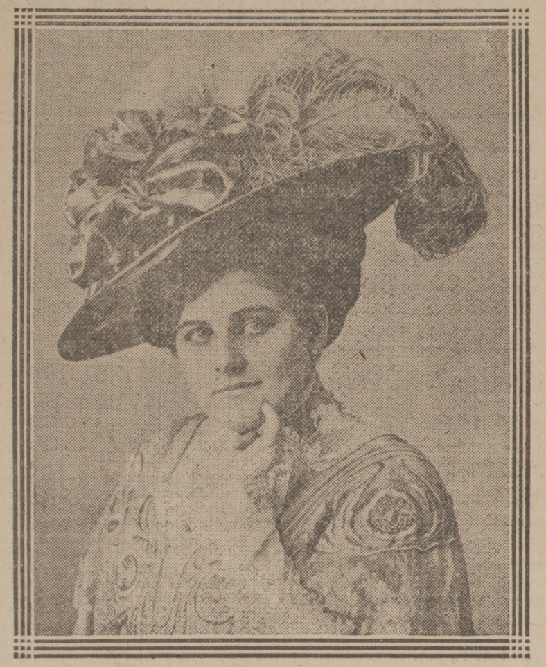
IN SMOKE GRAY AND SILVER.

The color scheme of this hat is not the least of its charms. The shape is a graceful side roll, with large moderately high crown. Crown and brim are of shaded maline, the latter satin bound. Encircling the crown is a band of silver braid and in front a huge rosette of soft loops of the same.