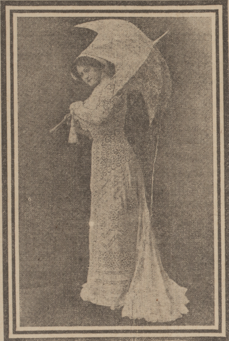
LINGERIE COSTUME SEEN AT PALM BEACH.

The summer girl was out in all her glory in the Southern summerland, and almost invariably her dainty afternoon frock in lingerie style was made of embroidery. The eyellet patterns are more popular, and such a pattern has been used here, the frock having the long lines and the fitted hip yoke, which will be universal this summer. The parafol is one of the new Parisian squares, with two pieces of Persian silk placed one over the other so that the eight corners come on the eight ribs of the frame.