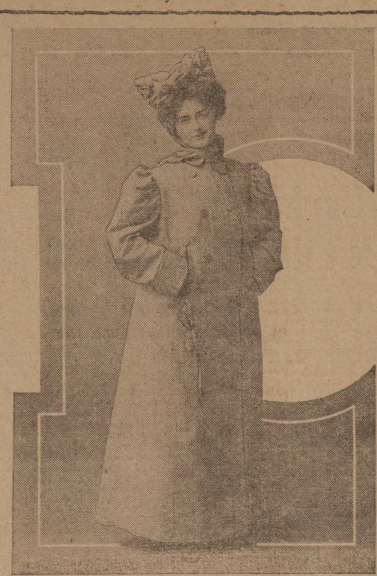
MOHAIR, THE IDEAL SUMMER MOTOR FABRIC.

Nothing is quite so satisfactory for summer motoring, driving and traveling as the long drape of mohair, and many of these coats are very attractive in cut and coloring.