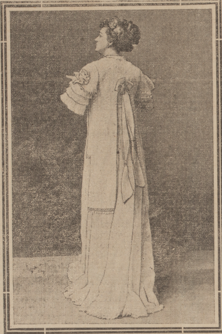
JUNE BRIDAL NEGLIGEE OF NET.

There is a certain quality of white cotton net which is washable and this practical white net, embroidered with coarse white floss, has been used for this charming negligee.