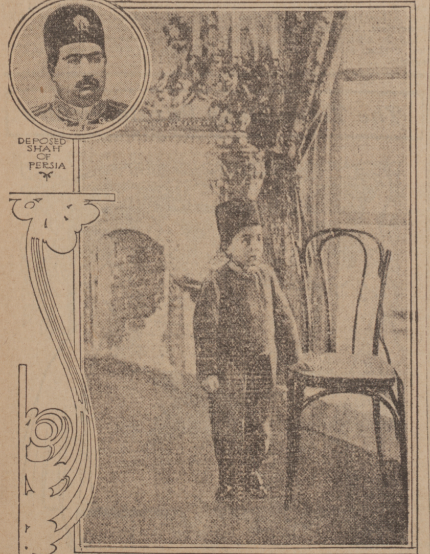
THE SHAH, ARMED MIEZA. Rome, Aug. 23—On the deposition, on July 19 last of Mohammed Ali Mirza, his son the youthful Ahmad Mirza, was proclaimed Shah by the representatives of the Persian nation, who met in extraordinary session at Teheran. Their action was the result of the disorders which had occurred in the whole country, culminating in the seizure of the capital by the nationalists and constitutionalists whose advances the Shah had proved himself powerless to resist. The young Shah is twelve year of age. He has been told in cable advices how the