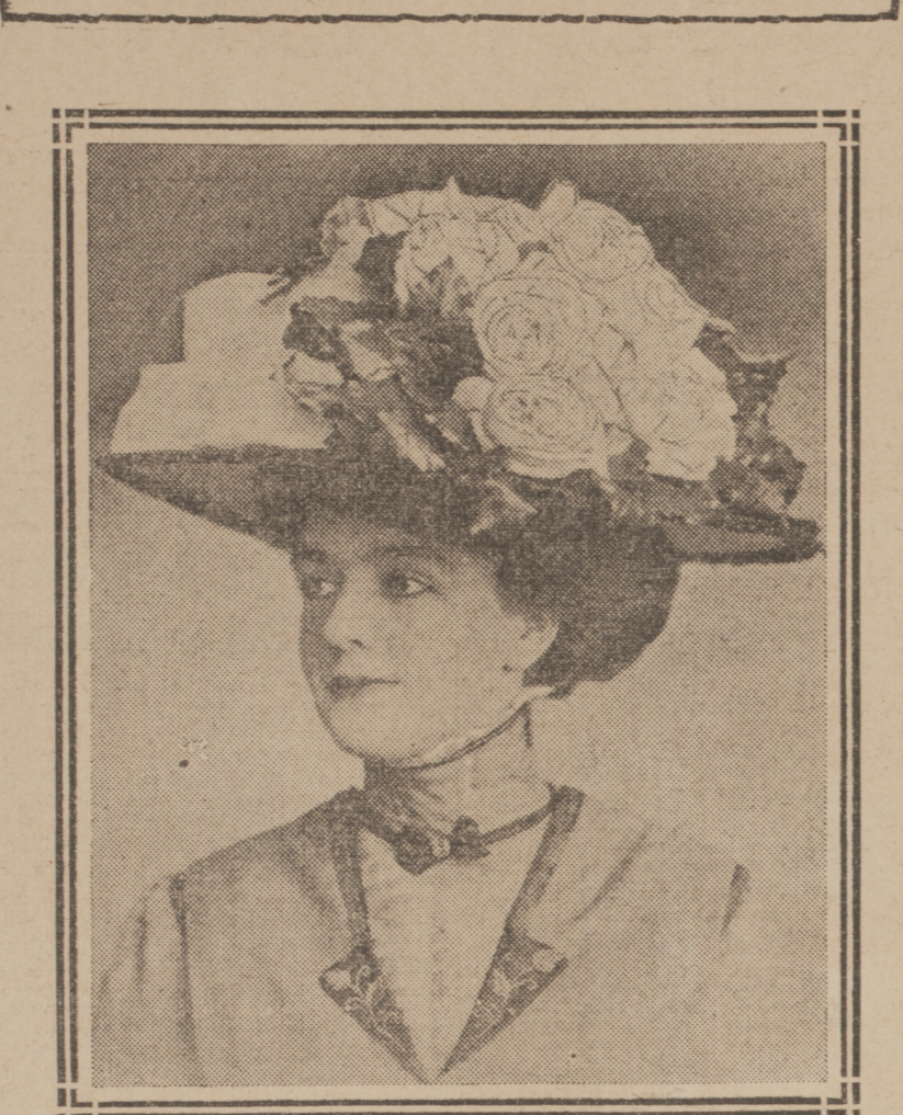
CABOCHON ARRANGEMENT OF ROSES. The pale buff of tea roses is here combined with the soft dull olives of bronze green foliage. The hat is black straw of rather coarse weave, with a facing of satin in the tea rose shade. A cloud of pale yellow tulle encircles the crown and makes an artistic background for the mass of yellow roses in their olive green leaves. This hat was designed to accompany a coat and frock suit. The upper part of the frock is shown, the bodice being built over a guimpe and sleeves of tulle net in the shade of the cloth.