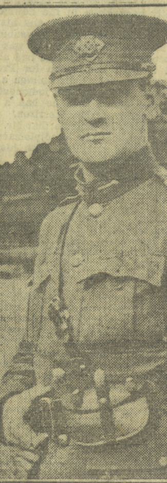
Leader of Free State forces and head of Ireland's provisional government, who met death at hands of the irregulars.