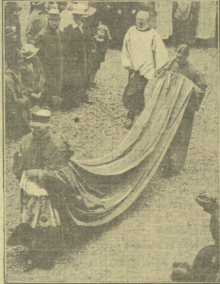
Cardinal Bourne bestowing his blessing as he entered Buckfast Abbey, Devonshire, England, at the dedication of the abbey church upon which the monks themselves had labored for 15 years.