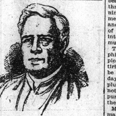
POPE PIUS X.