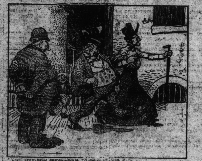
THE ORDER OF THE MOTHER-IN-LAW.

"I'll call his name. I hear that fulling voice of his up stairs. There's the way it went, Mr. Bowser, and the next thing I saw she had you by the ear on the stairs and was talking to you as if you were a mother-in-law. It's the mother-in-law, I s'pose?"